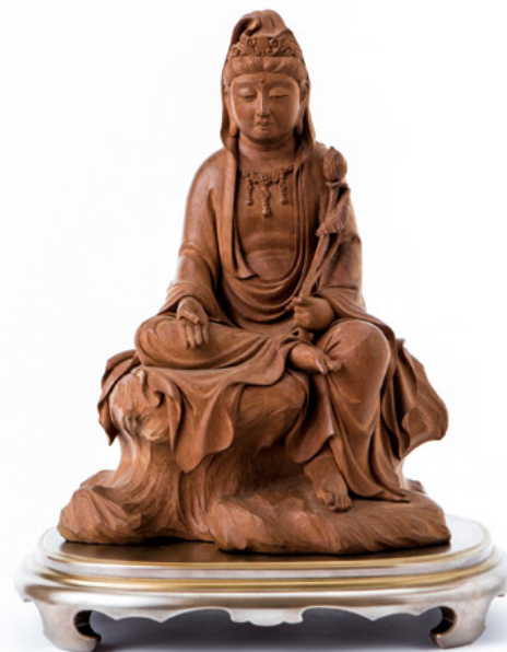
高村光雲 Takamura Koun

白衣観音 "Byakue Kannon" 17.5cm-12cm-23.2cm(h) 昭和七年秋季作 1932 Autumn