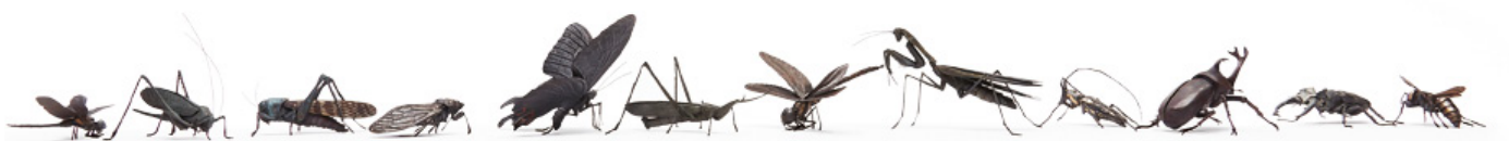
"Articulated twelve kinds of insects"

*Since there will be installation exhibits etc. from flowers, regretfully, we would like to decline any flower offerings to celebrate the reopening. Also, please do not bring anything when you visit us. Thank you.