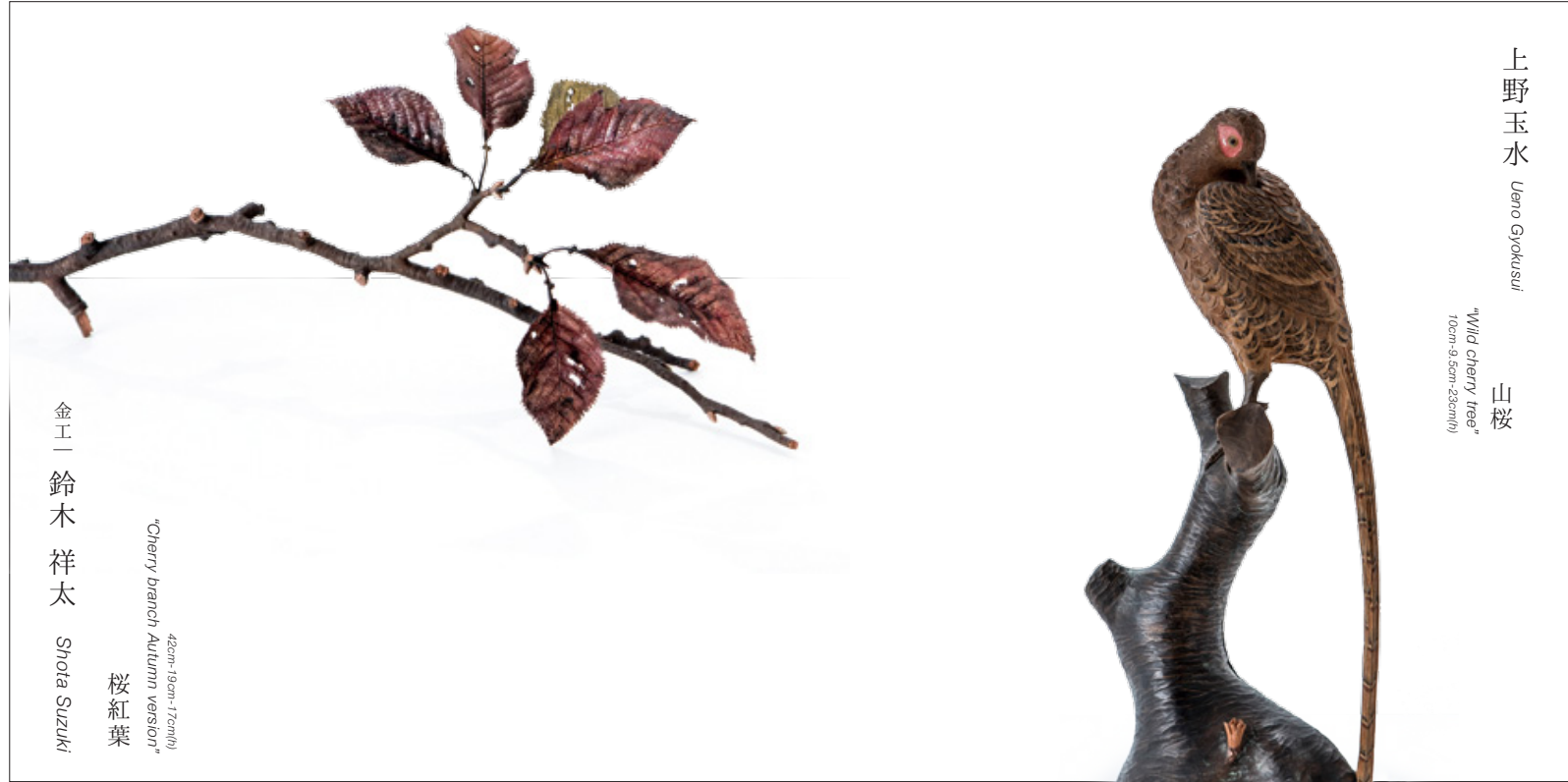
上野玉水 Ueno Gyokusai